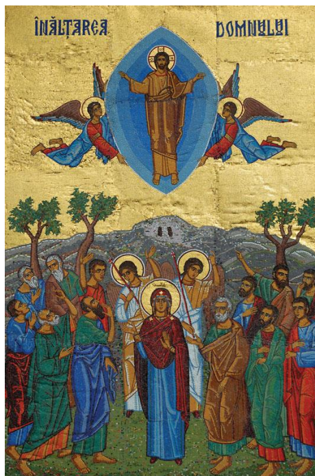
The Ascension of Jesus Christ, in Neamt Monastery, Rome.

And we remind ourselves that, though apart, we are still part of the body of Christ.