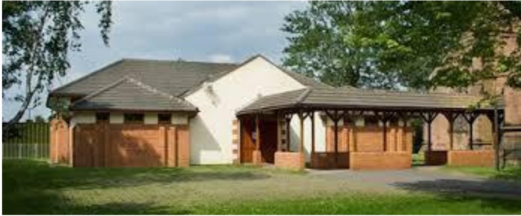
Bishop Allenby Hall