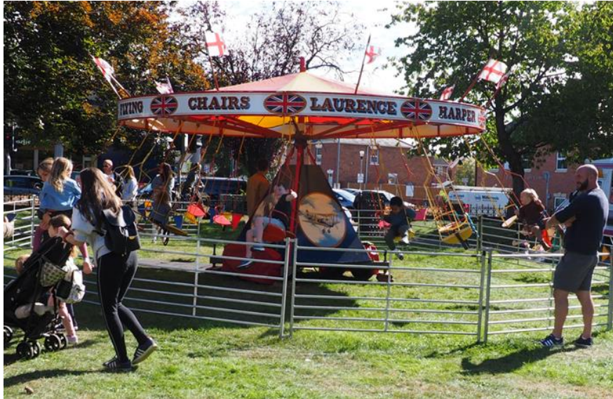
St Stephen's Autumn Fayre

"It was a lovely afternoon. Felt like a village fete. Loved the music and atmosphere and so nice to see young and old enjoying themselves."