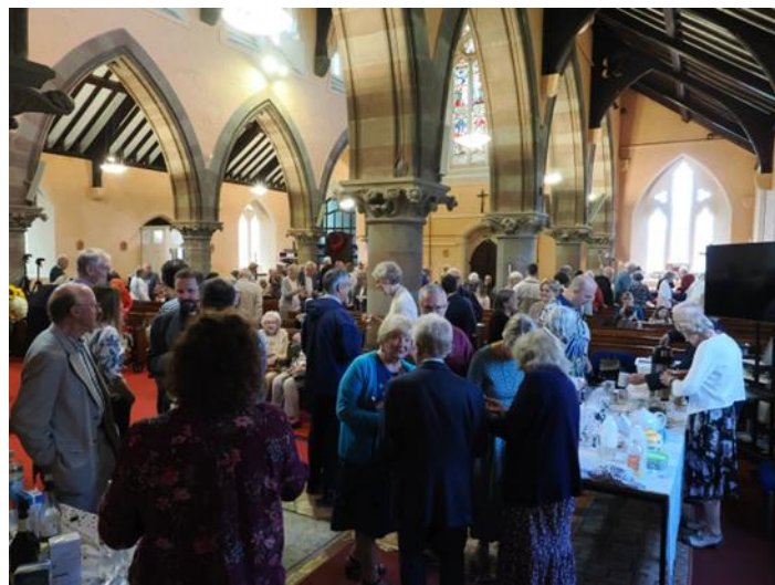
Bring and share lunch in church.

Special services during the year - Harvest, Remembrance of the Faithful Departed, Carols, and Nativity for local schools and nurseries - are highly valued by the community and are very well-supported. The Church is usually full at the crib service on Christmas Eve. We would like to extend the opportunities for participation by youth groups, such as the Brownies within these events. Musical performances by a variety of choral groups and choirs are also held reasonably frequently.